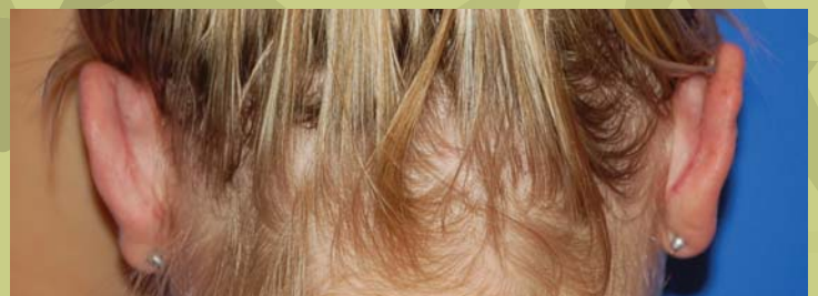
After - unretouched photo of actual patient