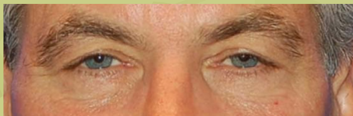
Before - unretouched photo of actual patient

"It was really a breeze for me," he says. "After a week the swelling was over. The scar was in the crease of my eyelid and disappeared completely in a month. The whole thing was quick and easy and a piece of cake for me. My lids look like they did 30 years ago. This was a very good experience – everything I could have wanted."