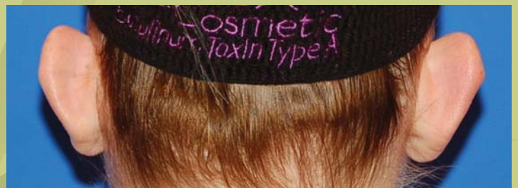
Before - unretouched photo of actual patient