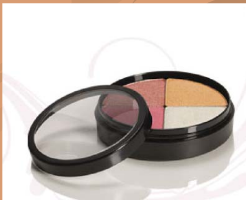
GloMinerals Shimmer Brick (Pictured)