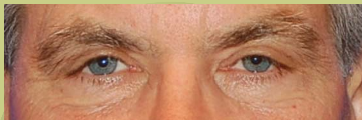
After - unretouched photo of actual patient