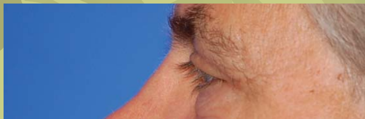
After - unretouched photo of actual patient