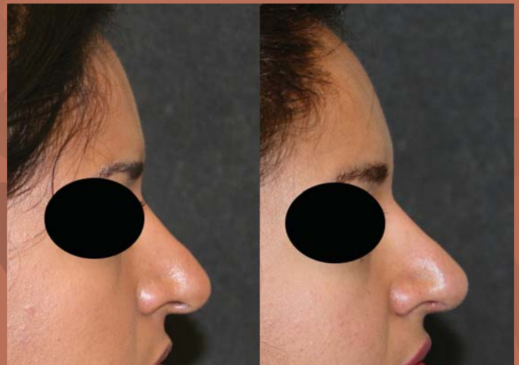
Before After unretouched photo of actual patient