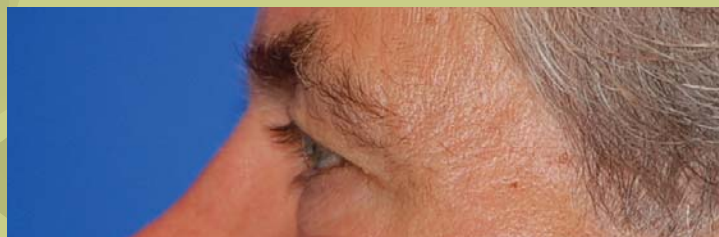
Before - unretouched photo of actual patient