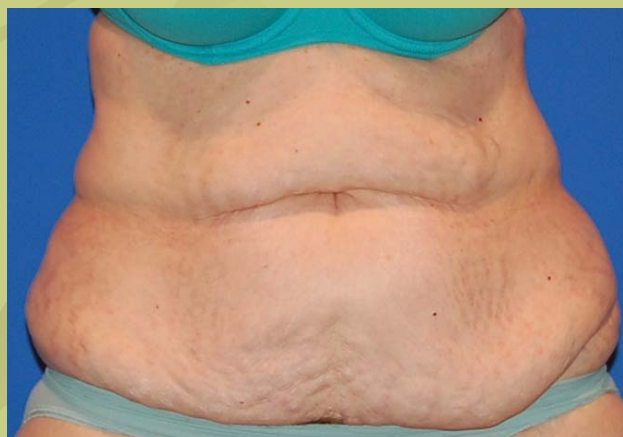
Before Tummy Tuck

Consider abdominoplasty if nothing you've tried has given you that flat stomach you crave. With your tummy tuck, you'll be fabulous with a toned, tighter body. You might just have to buy yourself a treat. How about a pair of Seven jeans for your stunning new look?