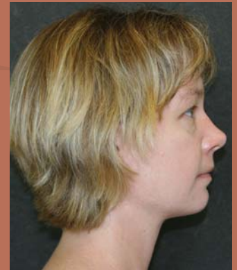
After Neck Procedure