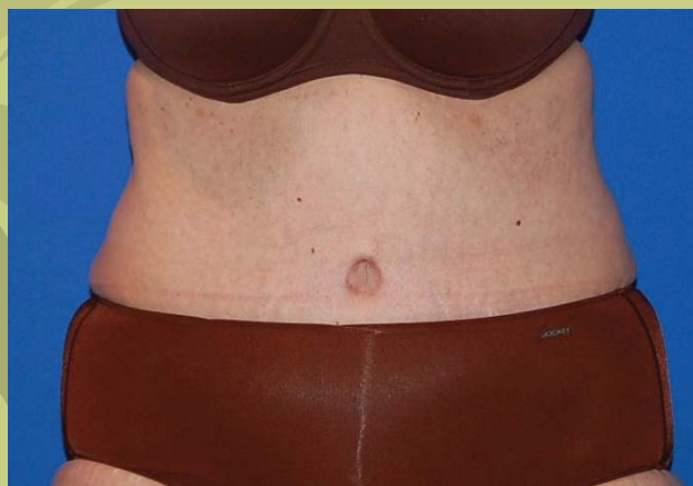
After Tummy Tuck