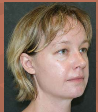
After Neck Procedure